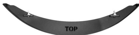
Top view upper cover plate